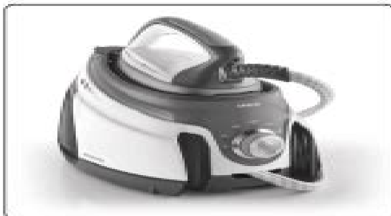
POLTI LA VAPORELLA XTXX - XT9XX - XH5XX

IT - Prima dell'utilizzo leggere attentamente le avvertenze di sicurezza | EN - Read the safety warnings carefully before use | FR - Lire attentivement les avertissements de sécurité avant utilisation | ES - Lea atentamente las advertencias de seguridad antes de usar | DE - Bitte lesen Sie vor der Anwendung die Sicherheitshinweise sorgfältig durch | PT - Leia atentamente as advertências de segurança antes de usar | NL - Lees de veiligheidsaanschuivingen zorgvuldig door voordat u ze gaat gebruiken | PL - Przed użyciem należy dokładnie zapoznać się z ostrzeżeniami dotyczącymi bezpieczeństwa | SE - Läs säkerhetsföreskrifterna noggrant före användningen.