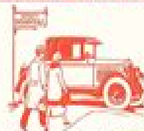
Here ready for professional men