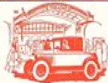
Grand rooms for social occasions