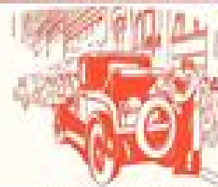
Dependability for commerce