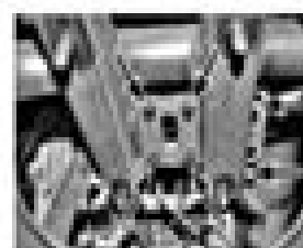
11.51 Under the six bolts (previously) securing the head, insert support blocks in the blockwork