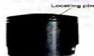
Fig. 6-2-9 Piston ring locating pin

Check the piston ring locating pins for wear or looseness, and if it is faulty, replace the piston.