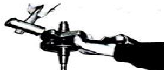
Fig. 6-2-12 Measuring clutch drive plate