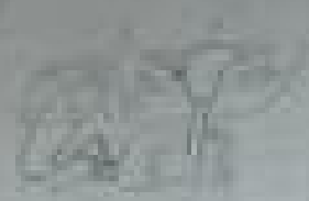
FIG. 10-10 Solenoid valves