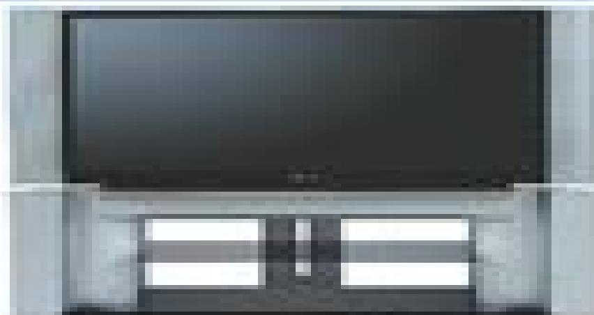
Optional Mounting Bracket