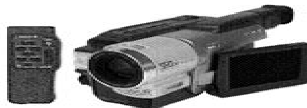
Photo : CCD-TRV98E

US Model CCD-TR618/TRV58/TRV68/TRV98 Canadian Model CCD-TR618/TRV58/TRV68/TRV98 AEP Model CCD-TR618/TRV58/TRV68/TRV98 UK Model CCD-TR618/TRV58/TRV68/TRV98 E Model CCD-TR618/TRV58/TRV68/TRV98 Australian Model CCD-TR618/TRV58/TRV68/TRV98 Hong Kong Model CCD-TR618/TRV58/TRV68/TRV98 Tourist Model CCD-TR618/TRV58/TRV68/TRV98 Chinese Model CCD-TR618/TRV58/TRV68/TRV98 Brazilian Model CCD-TR618/TRV58/TRV68/TRV98 Argentina Model CCD-TR618/TRV58/TRV68/TRV98 Korea Model CCD-TR618/TRV58/TRV68/TRV98