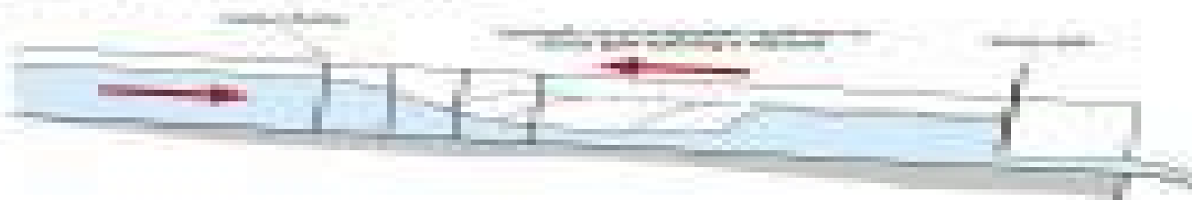
Figure 1 shows the setup for the experiment. The water flows from the wider section to the narrower section, and the pressure difference between the two sections is used to determine the flow rate. The flow rate is highest in the narrower section and lowest in the wider section.