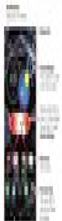
Diagram showing the flow of data between components.