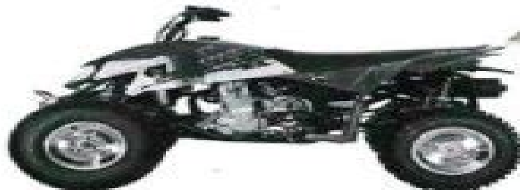
OUTLAW 525 IRS