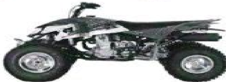
OUTLAW 525 S