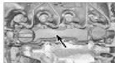
4.9 Undo the bolts and remove the oil separator (arrowed)