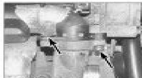
4.8a Slacken the left-hand turbocharger outlet hose bolt, undo the right-hand bolt (arrowed) ...