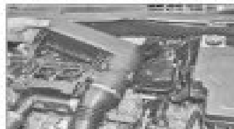
4.4b ... and remove the ducting/cover assembly

each injector, undo the guide bolts, then make sure all wiring harnesses are freed from any retaining brackets on the cylinder head cover/ inlet manifold (see illustration). Disconnect