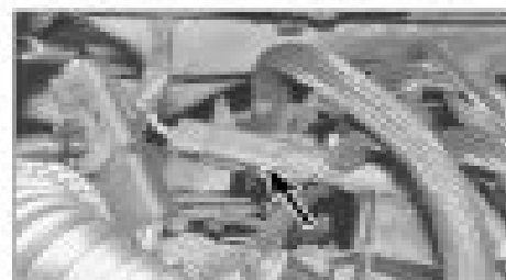
4.7b Disconnect the fuel temperature sensor wiring plug (arrowed) ...

each injector, undo the guide bolts, then make sure all wiring harnesses are freed from any retaining brackets on the cylinder head cover/ inlet manifold (see illustration). Disconnect