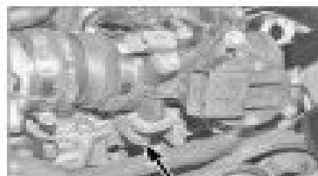
4.8c ... undo the bolt on the end (arrowed) ...