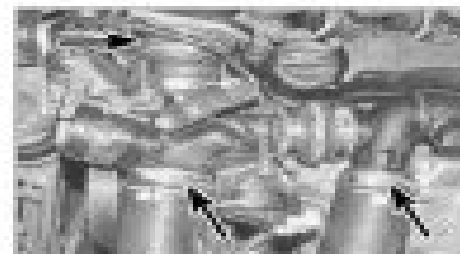
4.8b ... then slacken the base clamps (arrowed), disconnect the wiring plugs ...