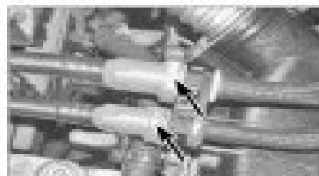
4.7a Depress the release buttons (arrowed) and disconnect the fuel feed and return hoses

6 Disconnect the wiring plugs from the top of