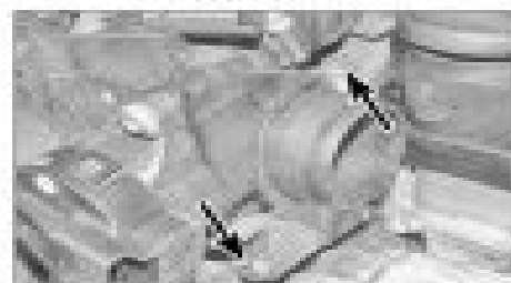
4.8d ... and the 2 at the front (arrowed), then remove the assembly