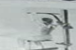
4 BACK OF NECK PRESS