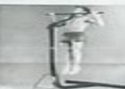
15 PULL UP