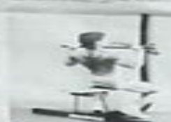
10 MILITARY PRESS