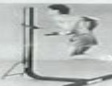
14 PULL UP