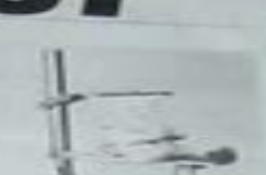
6 LEG PRESS