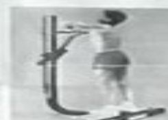
16 SPRINTER BOWING