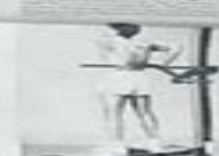
11 TRICEP EXTENSION