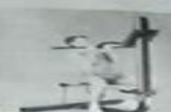
3 KNEE CURL LAT PULL