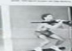
18 FRONTAL SQUAT