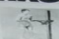
5 TRICEP PUSHDOWN