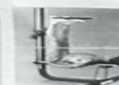
17 ROWING PRESS