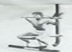
9 DORSAL BAR PULLDOWN