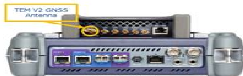
Figure 2: TEM V2