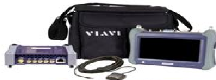
Figure 1: Equipment Requirements