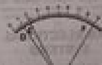
AMP-METER SCALE 0 Amperes through 15 Amperes

D = 5 Amperes E = 10 Amperes F = 15 Amperes