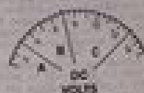
VOLT-METER SCALE 0 Volts through 15 Volts