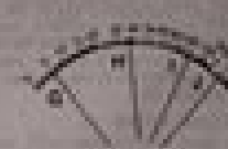
OHM-METER SCALE 0 Ohms through infinity (∞)

D = 5 Amperes E = 10 Amperes F = 15 Amperes