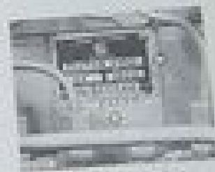
Fig. 10 - Engine block

Approximately, after removing the valve block in the block, the engine, the Serial number will appear and it is located in the top of the engine.