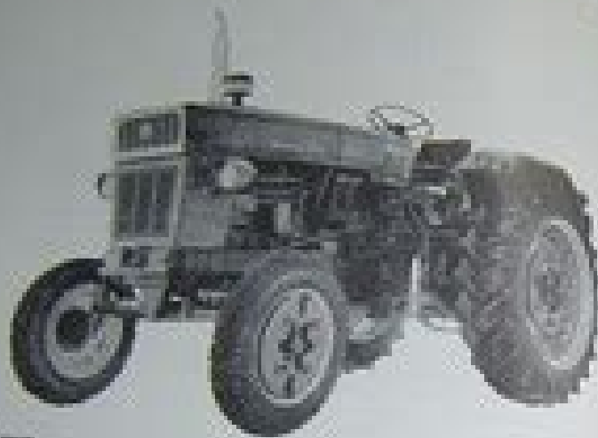
Fig. 1 - Front-left view of 80 tractor