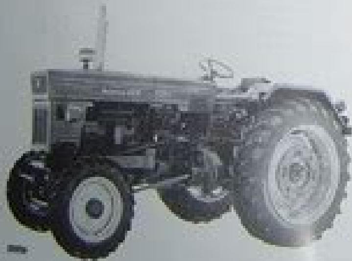
Fig. 2 - Front-right view of 80 tractor