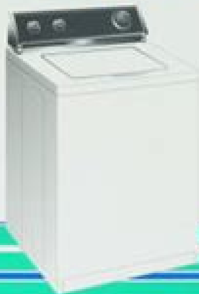
Automatic Washer (Direct Drive)

Easy-to-Follow Photographs and Step-by-Step Repair Procedures