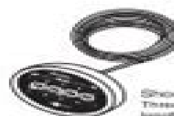
Shortcut #E22 Three different cable lengths available