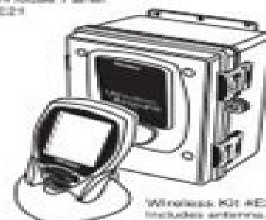
Wireless Kit #E20 Includes antenna, remote and charging base