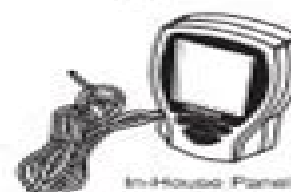
In-House Panel #E21