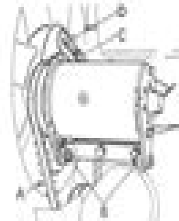
Figure 1. Test grid (continued).

Figure 10.27 shows the results of the regression analysis. The regression equation is \hat{y} = 1.00 + 0.0001x , where \hat{y} is the predicted number of hours worked and x is the number of children.