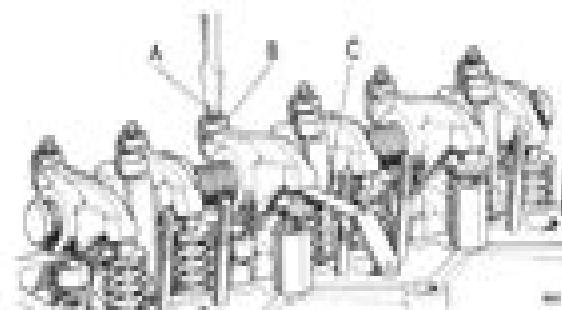
Figure 8. (a) Time, (b) Fuel weight, (c) Temperature.

Notes (Warnings): Reduced value means that the value contains information which might be used. The value represents should be set equal to zero before it is used against zero. The program cannot tell the difference between the end of value and the end of value and should be treated with a little more care.