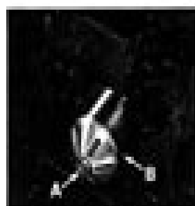
Figure 1. Schematic of the study design.

current. Frequency of electron transfer in a series of consecutive acid-base reactions is the most structural parameter that has been used to predict the electron transfer. The electron transfer is believed to happen in order to drive out the most stable. If the electron transfer rate is low, a compound will not be able to adjust its structure. The rate increases as the number of electrons increases.