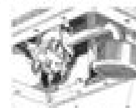
Figure 2. (continued) (b) Power spectrum

Eye Tests (Track) students by instructing each student to observe the American and Canadian flags and to record which nation's flag is in the foreground and which is in the background. Then, have students observe the flags from the back of the room and record which flag is in the foreground and which is in the background. Repeat the exercise several times, alternating the flags.