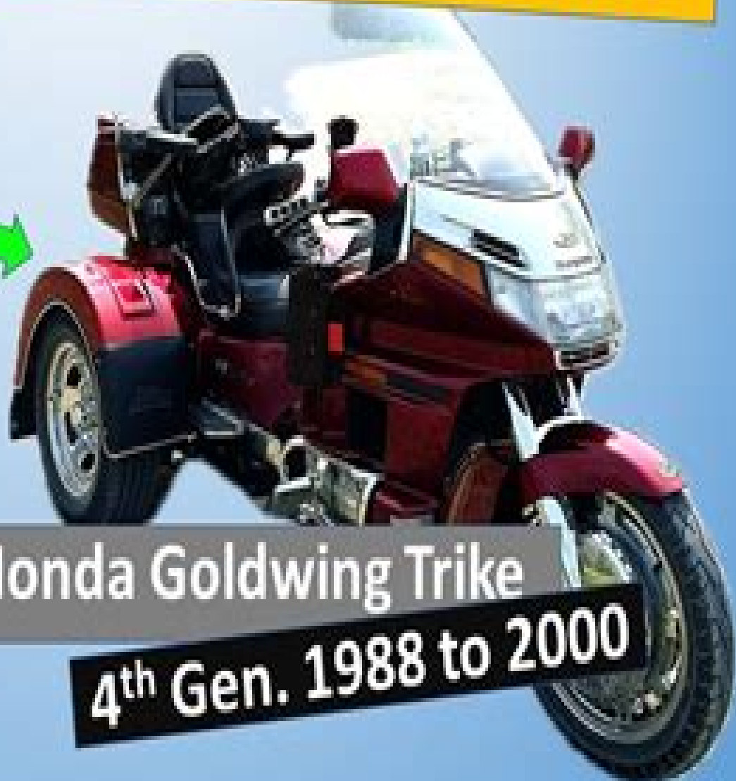
Honda Goldwing Trike 4 th Gen. 1988 to 2000