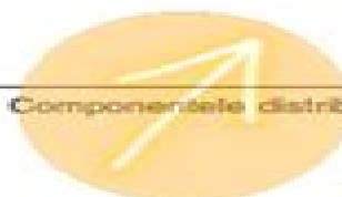
Fig. 21 Componentele distribuite în vehicul