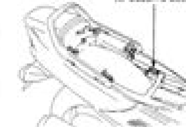
(4) COLOR LABEL

(4) The color label is attached as shown. When ordering color-coded parts, always specify the designated color.