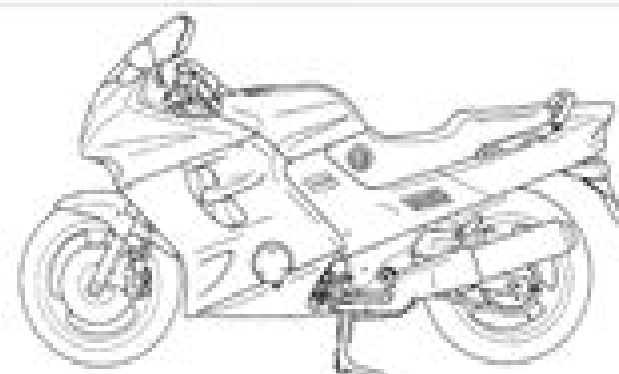
(1) FRAME SERIAL NUMBER