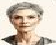
The Chief Elder

Jonas's friend who works in the House of the Old.