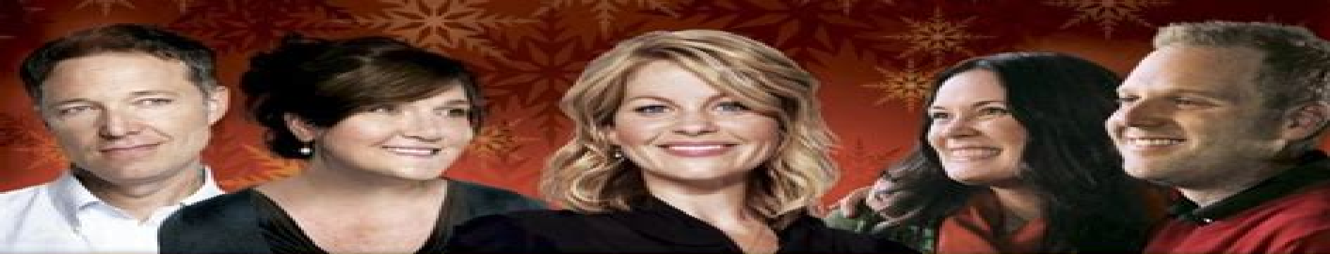
Candace CAMERON BURE