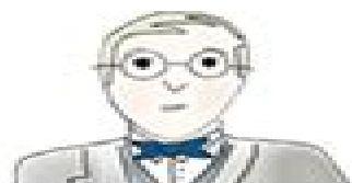
The Owl-Eyed Man