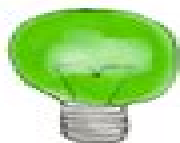
The Green Light