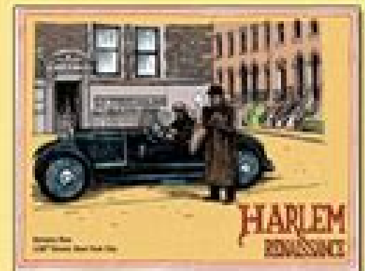
Strivers Row: Eubie Blake, Noble Sissle