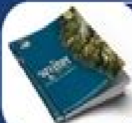
BHUOL MOOLBHOOT SIDDHANT