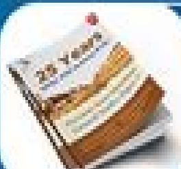
LAST 25 YEAR UPSC PRELIMS PYQ