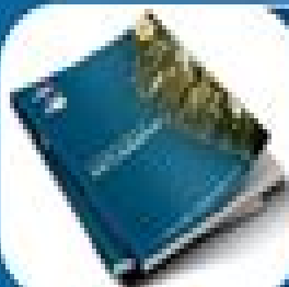
FUNDAMENTALS OF GEOGRAPHY