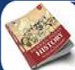
MODERN INDIAN HISTORY