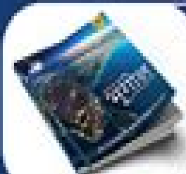
BHARAT KA BHUGOL