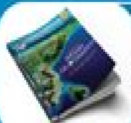
PRINCIPLES OF INDIAN GEOGRAPHY