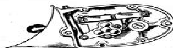
Clutch mechanism installed