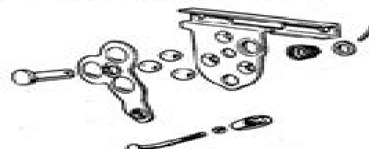
Clutch operating mechanism