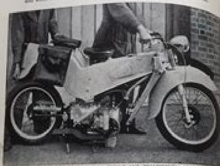
FIG. 13. REMOVAL OF FRAME FROM ENGINE AND TRANSMISSION UNIT

Fill only the cylinder and head jackets with water and start the pump. The water pump is best left disconnected from the cylinders for the present. Run the engine slowly until the water in the cylinders begins to boil and then stop the engine and go over all the cylinder head nuts, tightening any that require it. Let the water in the pump to the cylinder cooling and when the water has cooled down fill the radiator to the correct level.