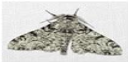
1. Light gray peppered moth

Before the year 1845, in the city of Manchester, England a population of light gray colored moths known as Peppered moths lived in the surrounding forests. They would cling to the trunks of trees that were covered with a light gray colored bark, like them.