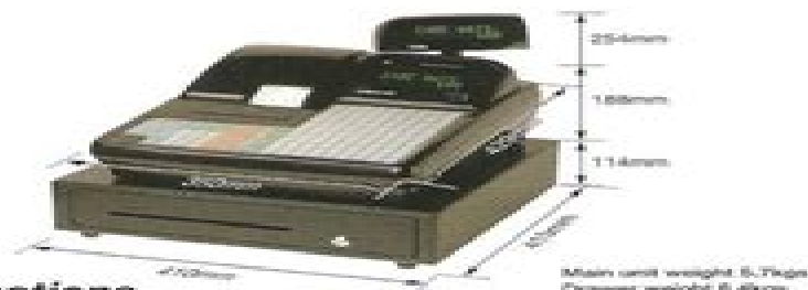
Main unit weight 5.7kgs Drawer weight 5.4kgs