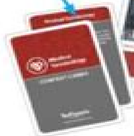
Context cards (65 qty)