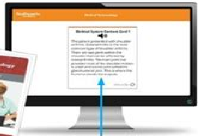
Online auditory context cards and flashcards