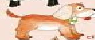
ci (cee) dog