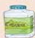
dŵr (d-oo-r) water