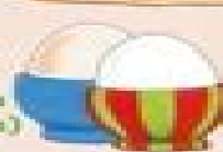
wyau (wea) eggs