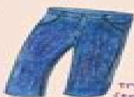
trowsus (trowsis) trousers