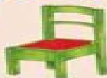
cadair (cader) chair