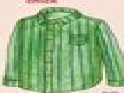
crys (crees) shirt