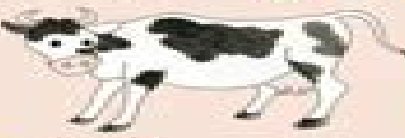
buech (beooch) cow