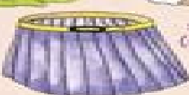
hosanau (hosanae) socks