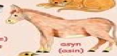
asin (asin) donkey