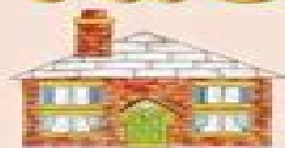
tŷ (tee) house