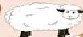
defad (davad) sheep