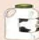
lloeth (cloeth) milk