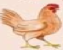
iâr (ya) hen