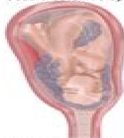
The cord dropping alongside the baby, but may not be seen in advance