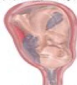
The cord coming before the baby's head can come out