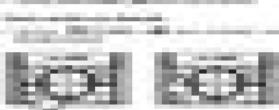
Figure 4: Change in muscle endurance (repetitions) over 12 weeks for three muscle groups.

Conclusion: The results of this study suggest that a 12-week resistance training program can effectively improve muscle strength and endurance in older adults. The program should be tailored to the individual's needs and abilities, and should be continued for long-term benefits.