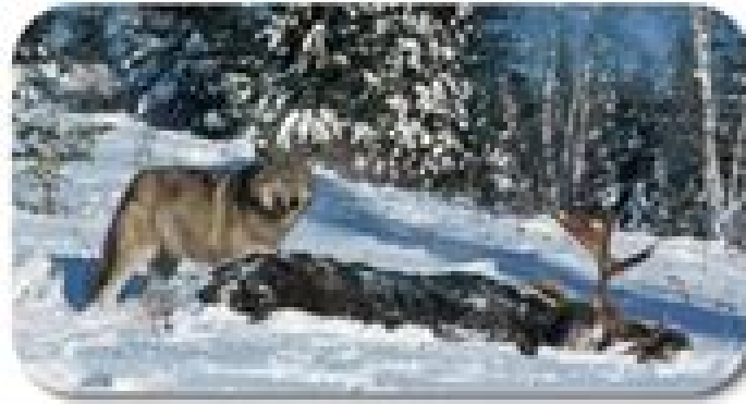
Wolf and Moose Populations on Isle Royale