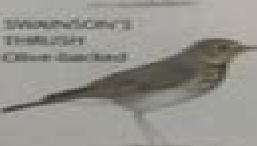
SWAINSON'S THRUSH Olive-backed