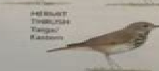
HERMIT THRUSH Tanager Eastern