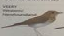
VEERY Catharus fuscescens