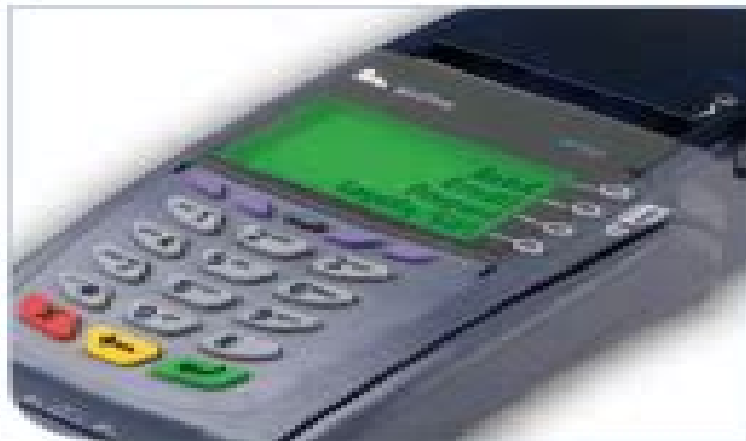
VeriFone® Omni Vx Series