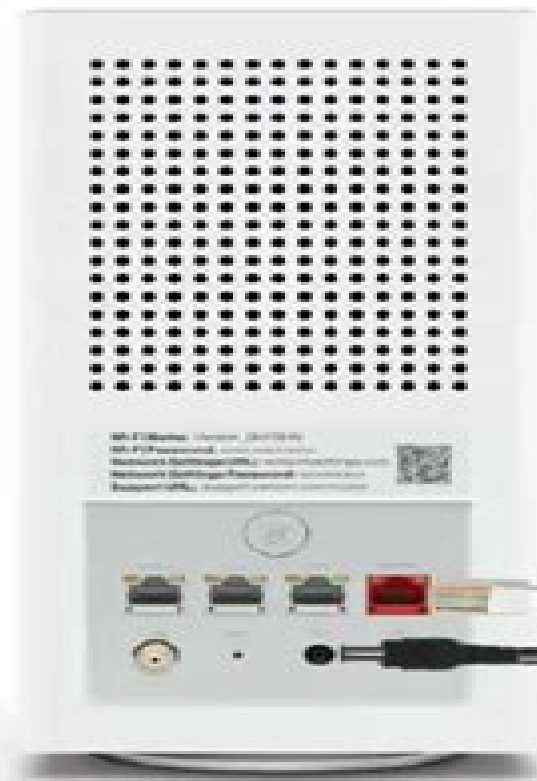
Verizon Router back