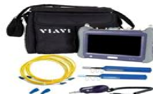
Figure 1: Equipment Requirements