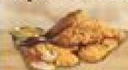
5 pc. Tenders