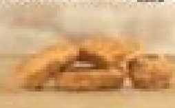
4 Chicken Nuggets