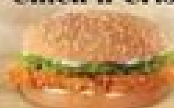
Chick n Crisp