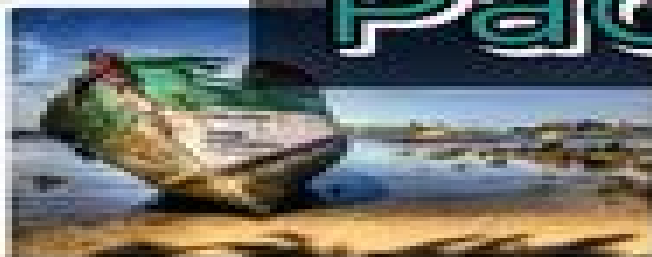
Unit 4: Swift and Defoe