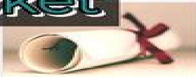
Unit 5: Semester Wrap-Up