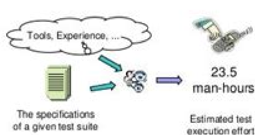
Manual Test Execution Effort Estimation