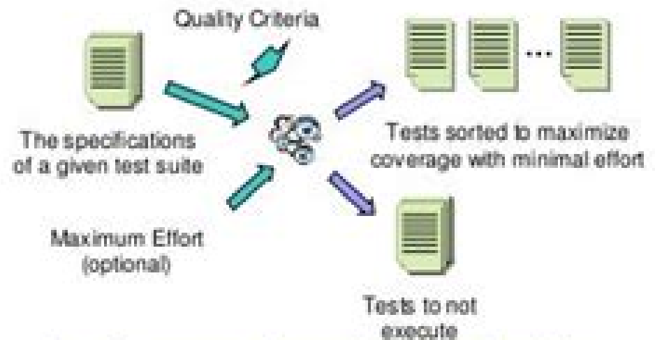
Test Coverage x Execution Effort Analysis