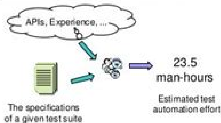
Test Automation Effort Estimation