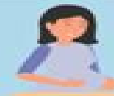
Age 35 or older