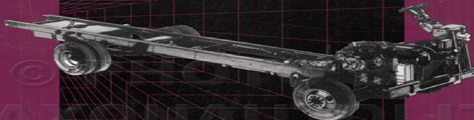
Class A Motorhome