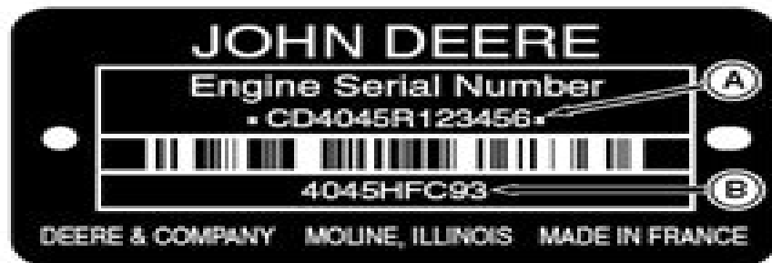
Saran Factory Engine Identification Plate