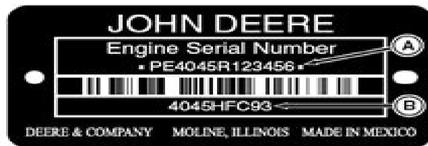
Torreon Factory Engine Identification Plate

A—Engine Serial Number B—Engine Model Number