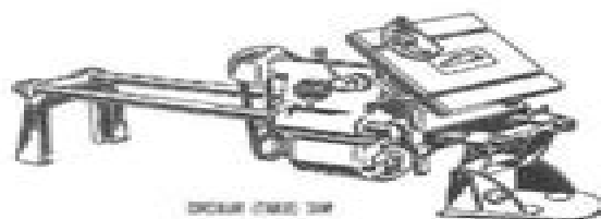
SHARP (TWO) TIP