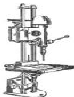
VERTICAL DRILL PRESS