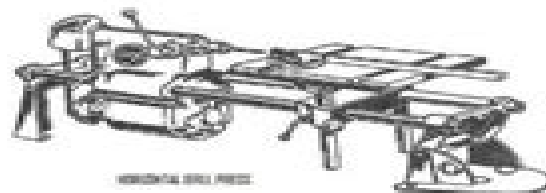
HORIZONTAL DRILL PRESS