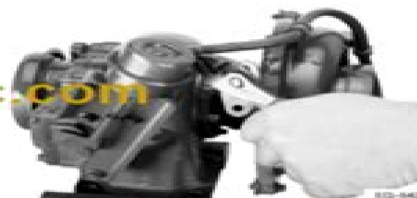
Figure 2.11 Remove Hose Clamp