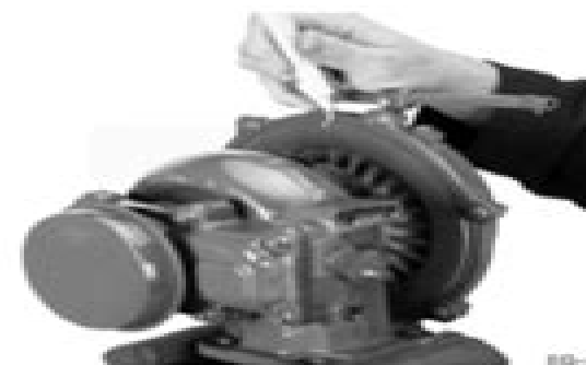
Figure 2.10 Mark Compressor/Backplate Location