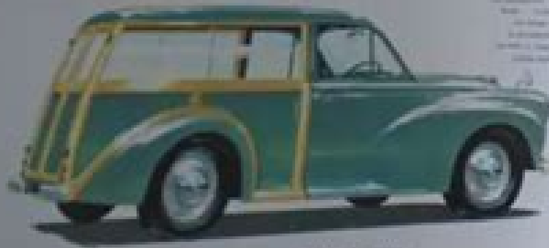
MORRIS MINOR STATION WAGON A spacious, comfortable car with extra room, luggage space and extra load capacity. The perfect car for family.

No wonder these are motoring's most wanted light cars!