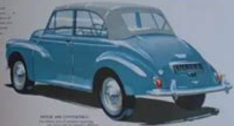
MORRIS MINOR CONVERTIBLE The most fun of motoring cars. An open car in every sense. With extra room, extra load capacity and extra fun.