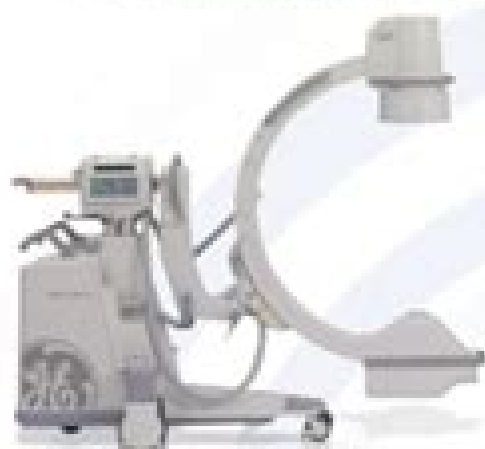
Standard C 9" Q3cm (I)