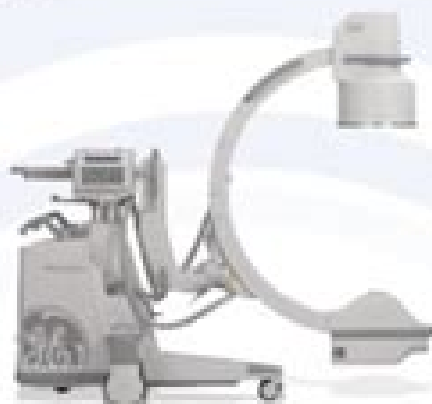
Standard C 12" D15cm (I)