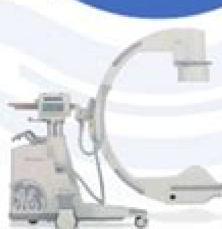
Super C 9" Q3cm (I)